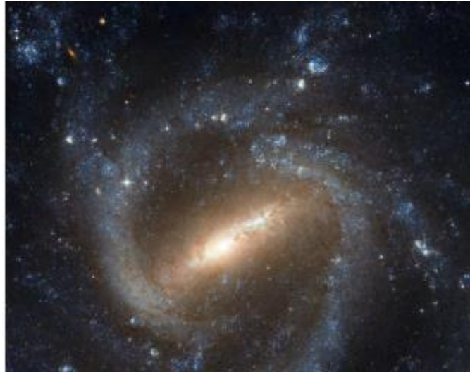
Figure 1.9 Spiral Galaxy. This galaxy of billions of stars, called by its catalog number NGC 1073, is thought to be similar to our own Milky Way Galaxy. Here we see the giant wheel-shaped system with a bar of stars across its middle.

light-years, we finally encompass the entire Milky Way Galaxy. Our Galaxy looks like a giant disk with a small ball in the middle. If we could move outside our Galaxy and look down on the disk of the Milky Way from above, it would probably resemble the galaxy in Figure 1.9, with its spiral structure outlined by the blue light of hot adolescent stars.