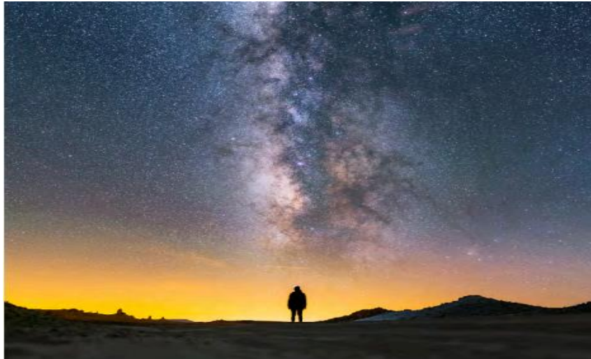
Figure 1.10 Milky Way Galaxy. Because we are inside the Milky Way Galaxy, we see its disk in cross-section flung across the sky like a great milky white avenue of stars with dark “rifts” of dust. In this dramatic image, part of it is seen above Trona Pinnacles in the California desert.

Typically, the interstellar material is so extremely sparse that the space between stars is a much better vacuum than anything we can produce in terrestrial laboratories. Yet, the dust in space, building up over thousands of light-years, can block the light of more distant stars. Like the distant buildings that disappear from our view on a smoggy day in Los Angeles, the more distant regions of the Milky Way cannot be seen behind the layers of interstellar smog. Luckily, astronomers have found that stars and raw material shine with various forms of light, some of which do penetrate the smog, and so we have been able to develop a pretty good map of the Galaxy.