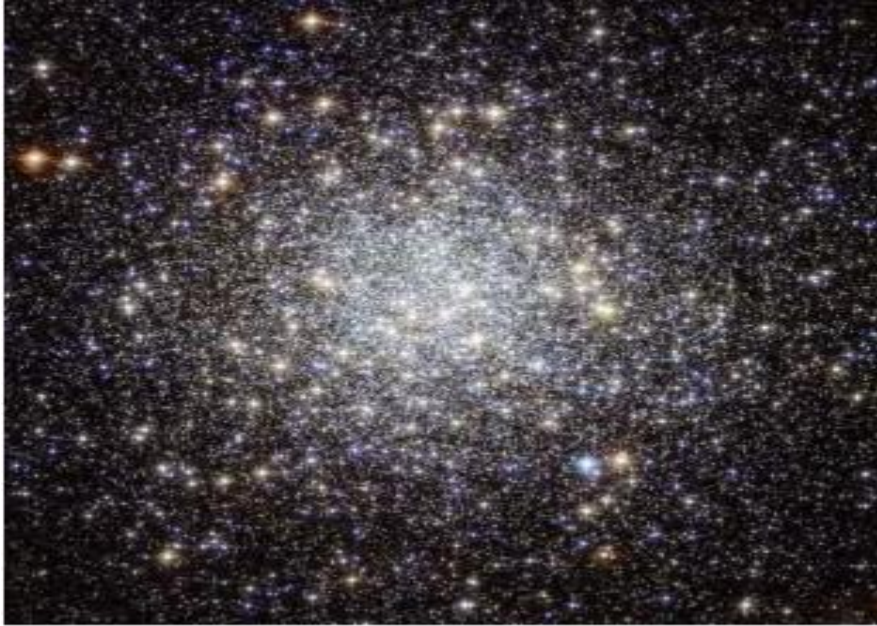
Figure 1.11 Star Cluster. This large star cluster is known by its catalog number, M9. It contains some 250,000 stars and is seen more clearly from space using the Hubble Space Telescope. It is located roughly 25,000 light-years away.

You may hear stars referred to as “eternal,” but in fact no star can last forever. Since the “business” of stars is making energy, and energy production requires some sort of fuel to be used up, eventually all stars run out of fuel. This news should not cause you to panic, though, because our Sun still has at least 5 or 6 billion years to go. Ultimately, the Sun and all stars will die, and it is in their death throes that some of the most intriguing and important processes of the universe are revealed. For example, we now know that many of the atoms in our bodies were once inside stars. These stars exploded at the ends of their lives, recycling their material back into the reservoir of the Galaxy. In this sense, all of us are literally made of recycled “star dust.”