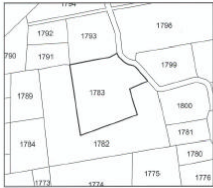
មាត្រដ្ឋាន 1/ 2500

អាស័យដ្ឋាន ភូមិភ្នំដំរី ឃុំជំណាក់កន្ទួតខាងជើង ស្រុកកំពង់ក្រោច ខេត្តកំពត ប្រភពនៃការផ្តល់ដី រដ្ឋប្រគល់ដោយ បទដ្ឋាន គ្មាន