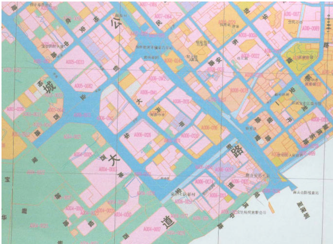
Figure 3: An example of the land classification map in Shenzhen city, Guangdong Province.