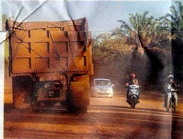
Dusty commute: Motorcyclists covering their faces as a truck carrying bauxite passes by in Bukit Goh, Kuantan.

Wan Junaidi said the Government did not intend to impose an outright ban on Pahang's bauxite industry but was serious about finding a long-term solution to the issue.