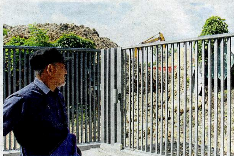
Oon (left) went to the ground to investigate the matter and saw tipper lorries transporting sand from the river.

Aerial photographs showed a discharge of murky substance from the site which flowed through a