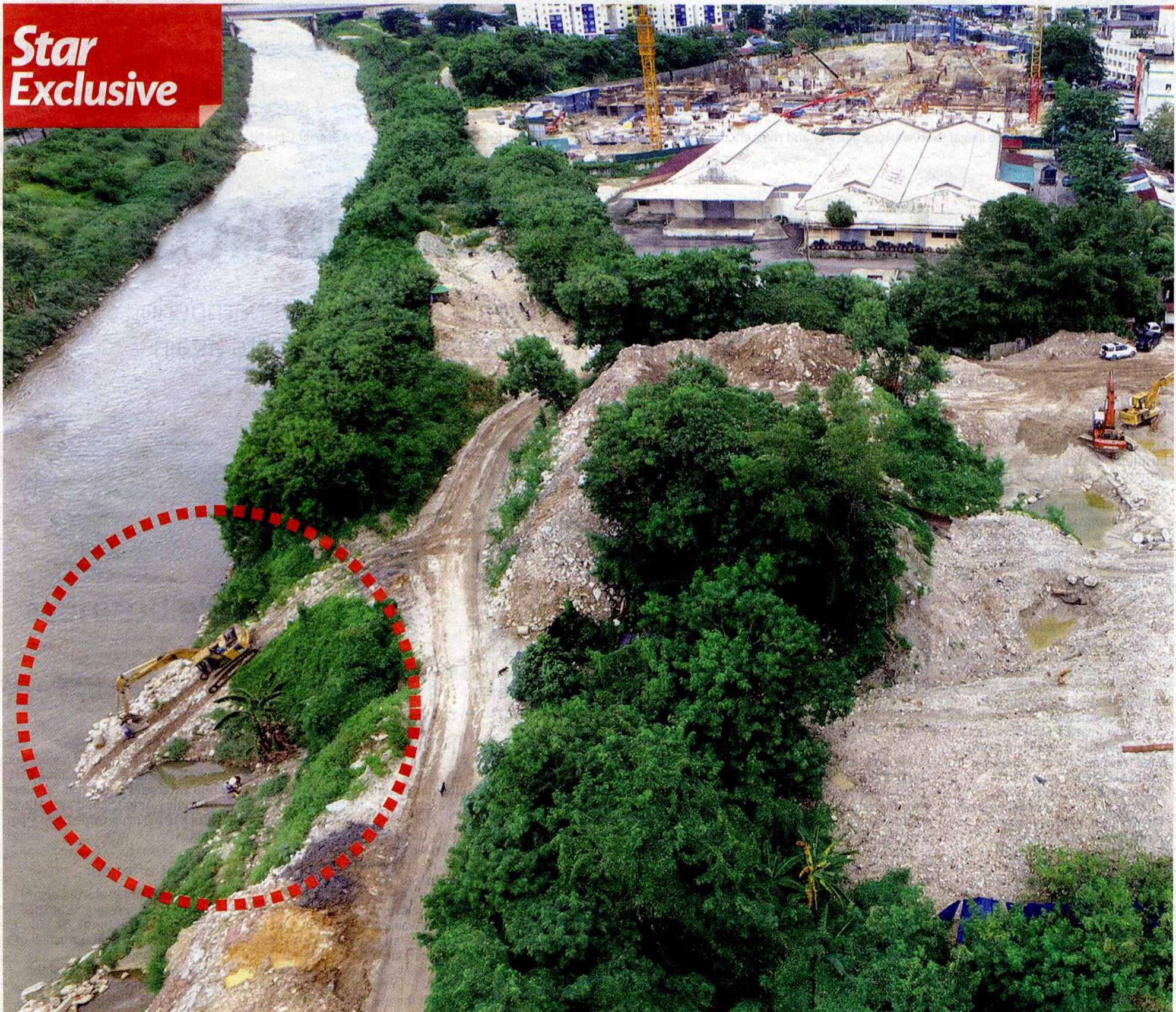
Sneaky activities: An aerial view of the sand-washing operation near 5th Mile off Jalan Kelang Lama found to be active again after two years. An excavator is also seen encroaching into the riverbank.