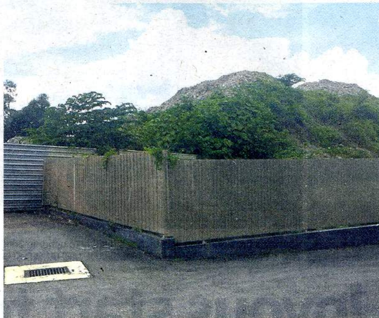
At ground level, one cannot see anything as the illegal sand washing site is blocked by hoardings and trees.

and as it entered the Ampang township, the quality dropped to Class III.